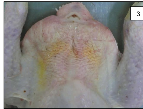
Figure 3: Bilateral cellulitis lesion in the vent area.