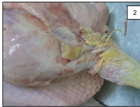
Figure 2: Skin removed.