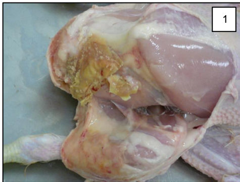
Figure 1: Skin reflected to reveal pus plaque and inflammation.